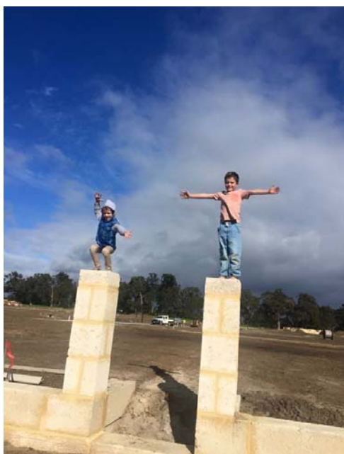
Local youngsters celebrate Mum & Dad's purchase of a block in Country Vines Estate.

Affordable and Classy is NOT a common combination so tell your friends and family but not before you call Mark now to get an information pack and secure your block with a deposit today!